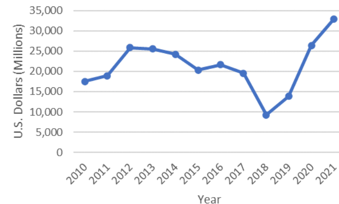
Total U.S. Agricultural Exports to China