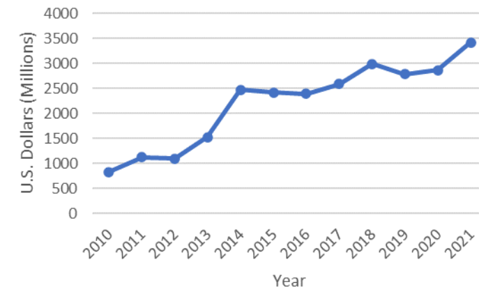
Total U.S. Agricultural Exports to Colombia